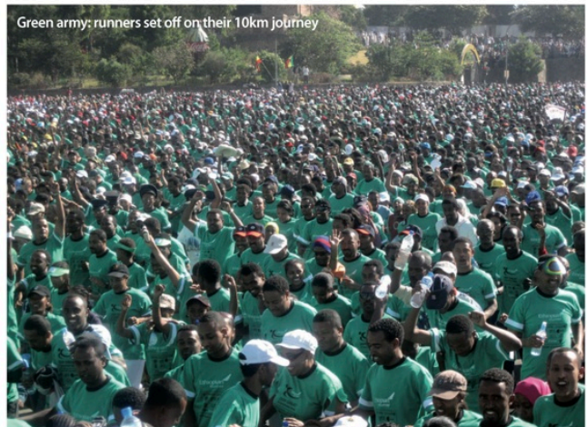
Green army: runners set off on their 10km journey

walked toward the start line in Meskel Square. Within an hour this became a jammed procession and everyone was wearing a green T-shirt that was the colour chosen for this year's race (each year a colour is chosen which is associated with the Ethiopian flag).