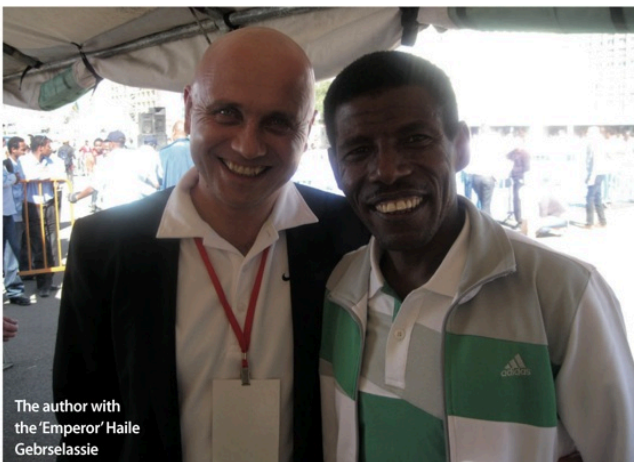
The author with the 'Emperor' Haile Gebrselassie

The purpose of our visit was for Hartmann, a world renowned physical therapist, to offer education in three main areas to a selected audience of elite Ethiopian athletes, coaches and medical support personnel over a series of three workshops, lectures and practical demonstrations. These would run from November 18-20 in three-hour blocks each day with the remainder of the day devoted to clinical screening of a select number of Ethiopia's most successful athletes.