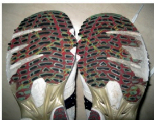
Sole survivors: Tirunesh Dibaba's shoes